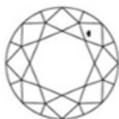
VVS1 / VVS2 Very Very Slightly Included